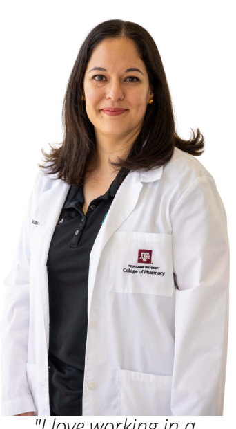
"I love working in a collaborative pharmacy team that consistently strives to improve patient care."

<u>Pharmacy School</u>: University of Texas at Austin College of Pharmacy Class of 2011