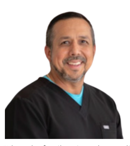
"I love the family-oriented, team-like approach to advancing our pharmacy department operationally, clinically and academically."

<u>Pharmacy School</u>: University of Texas at Austin College of Pharmacy Class of 2000