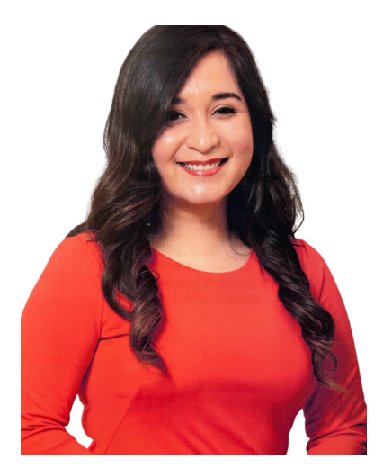
"I love that DHR is commited to bringing inovative care to the South Texas community where before patients had to seek care elsewhere."

<u>Pharmacy School</u>: University of Texas at Austin College of Pharmacy Class of 2014